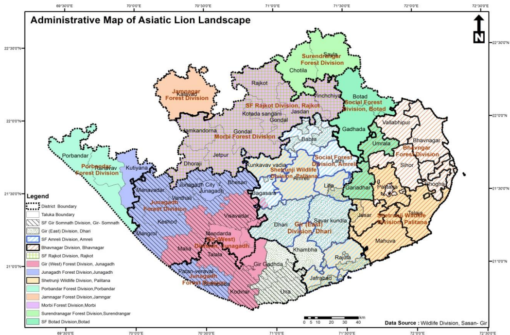
Figure 2: Administrative units in the Asiatic Lion Landscape for the Poonam Avlokan of Asiatic Lions (June 2020).